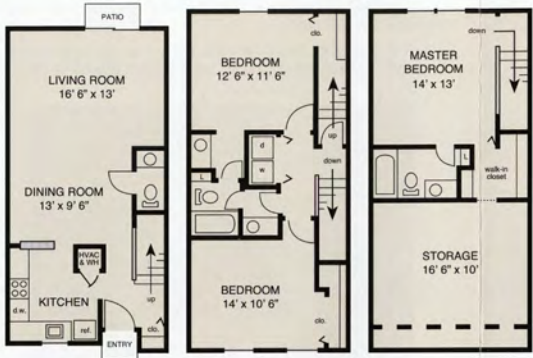
The YORK 3 Bedroom 2 & 1/2 Bath Townhouse 1705 Square Feet* Rental Rate: $ _____