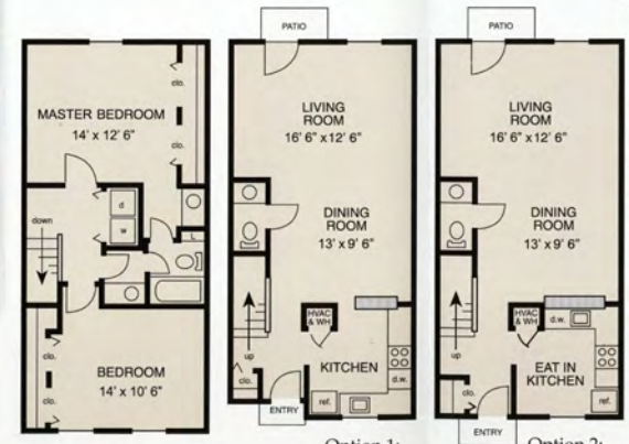
Option 1: 1154 Sq.Ft.* Option 2: 1181 Sq.Ft.*