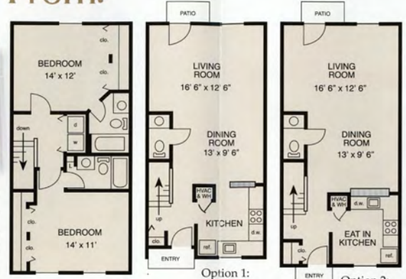
Option 1: 1154 Sq.Ft.* Option 2: 1181 Sq.Ft.*